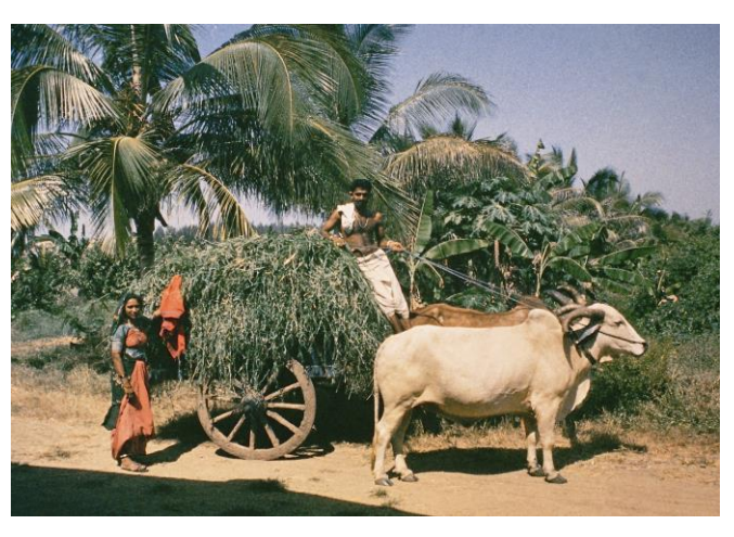
Grass is a Nature Blessing for Livestock.